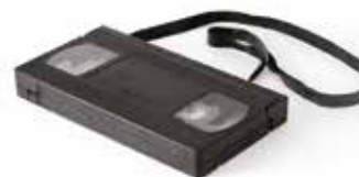
Photo slideshows Audio tape to CD/MP3 DVD to MP4

Tel: 07944 023 597 email: jlorrimer@icloud.com